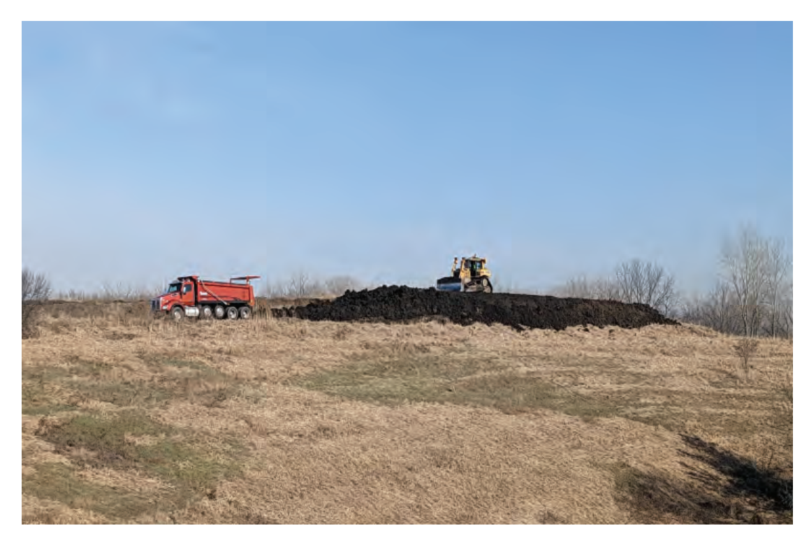
Cap project awaiting seeding and minor erosion repairs