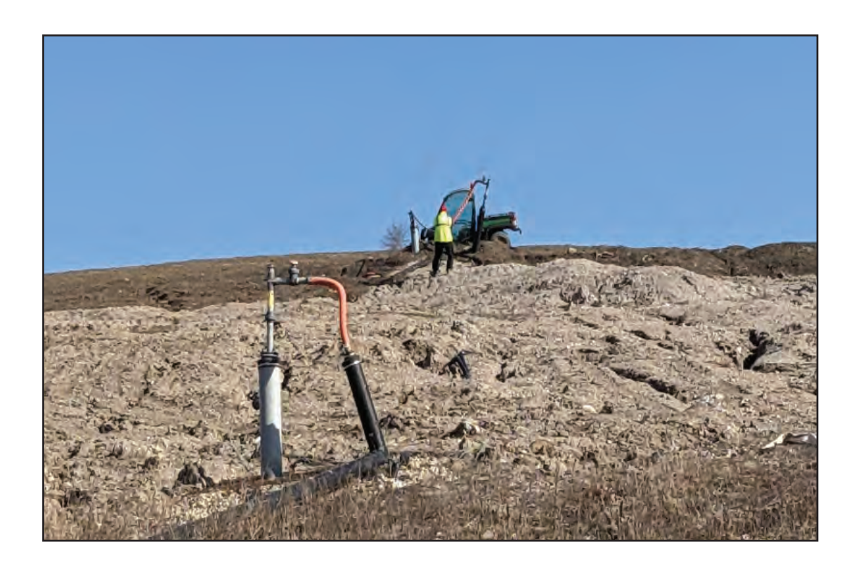
Slope erosion on Phase 2 and gas tech actively tweaking well field