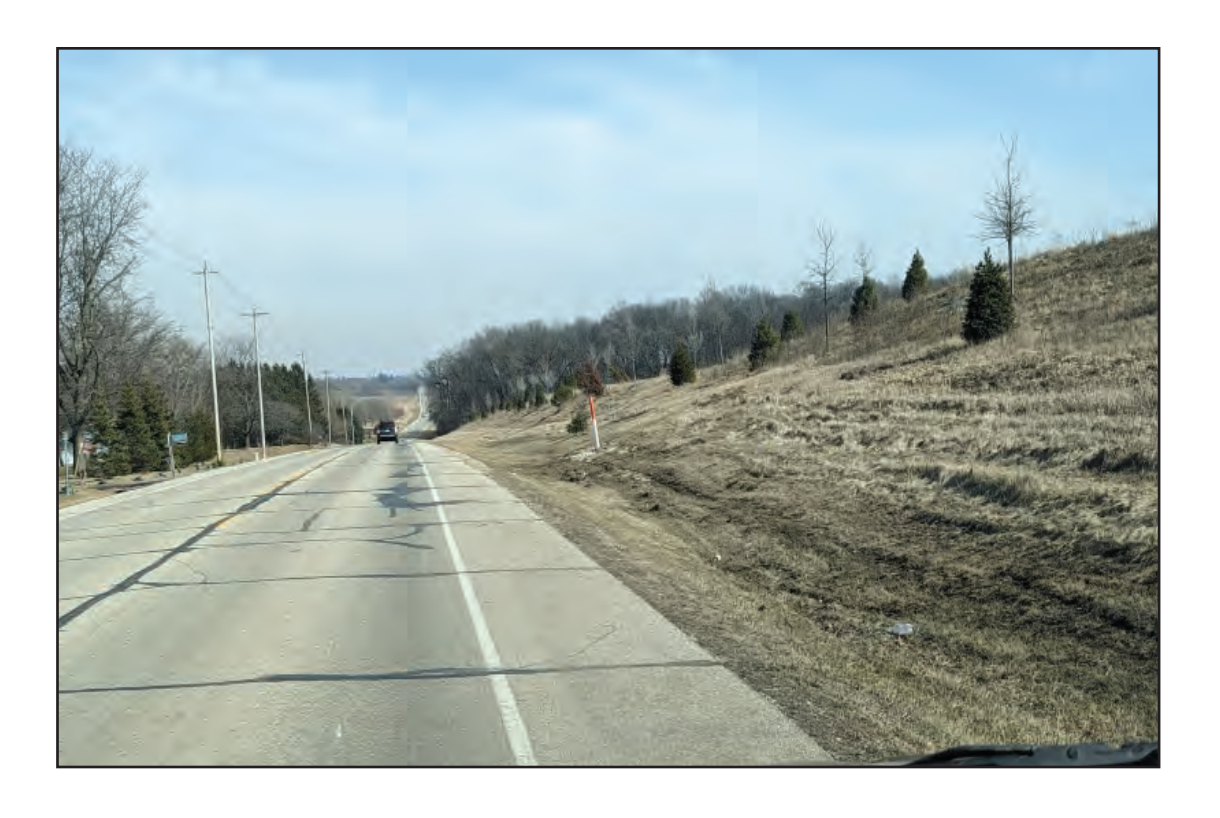
Screening berm along 38th Street; plantings appoear to be in bad shape. Contractor responsable for restoration