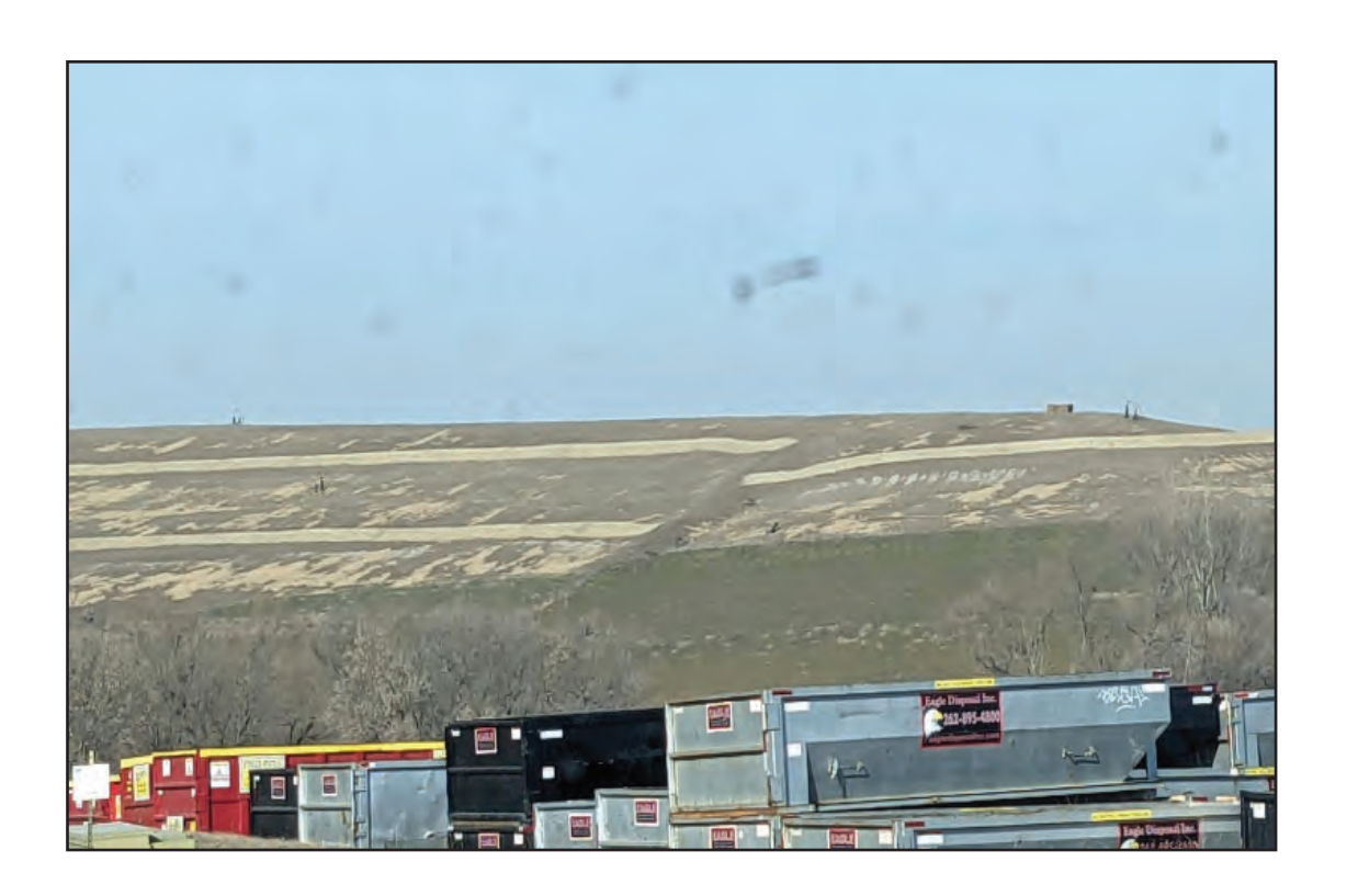
Cap project awaiting seeding and minor erosion repairs