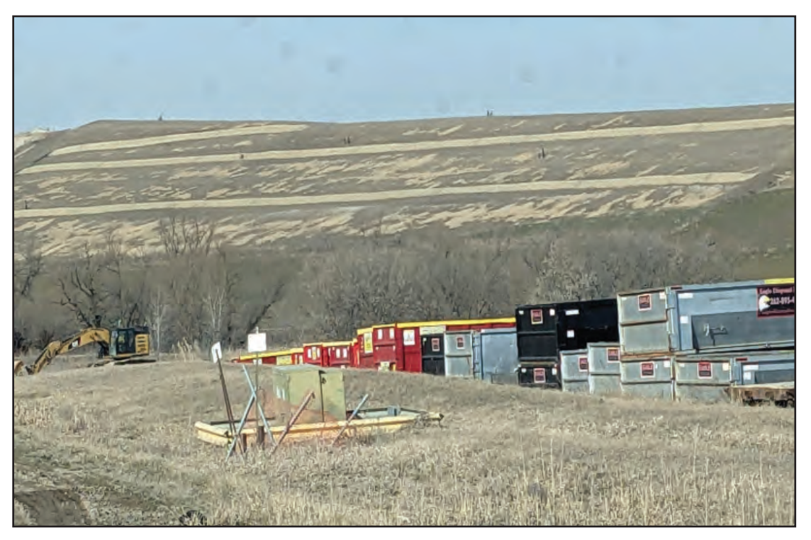
Cap project awaiting seeding and minor erosion repairs