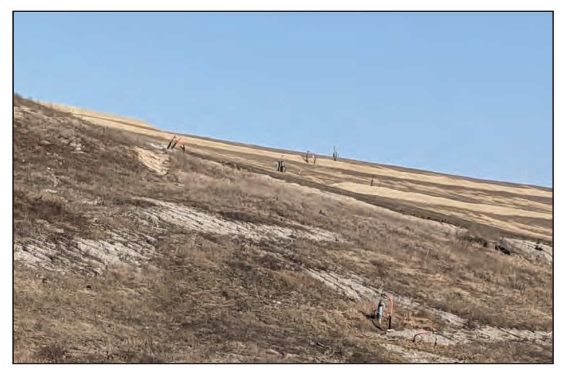
Cap project awaiting seeding and minor erosion repairs