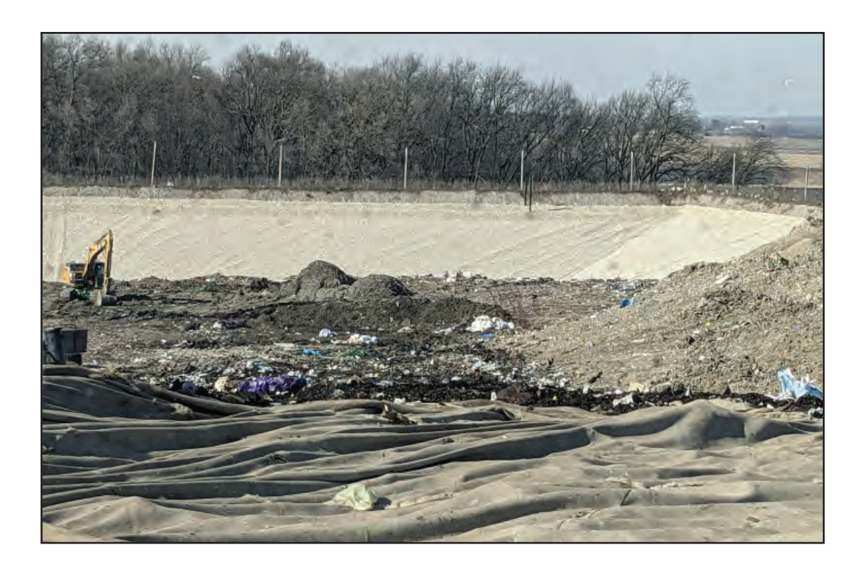
Phase 3 module 2