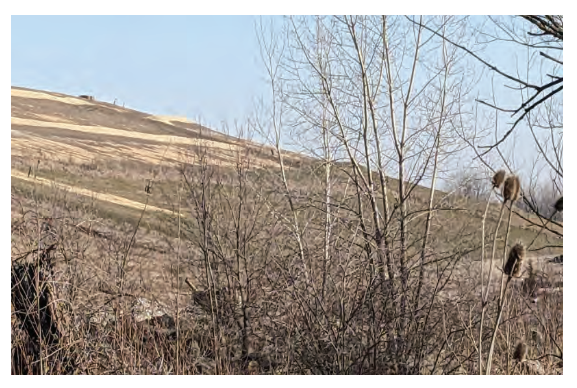
Cap project awaiting seeding and minor erosion repairs