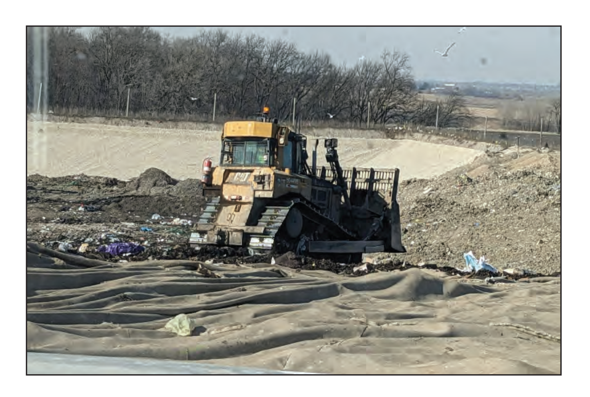
Dozer shaping cover, tarp pulled back on covere