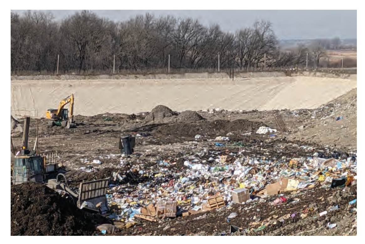
Phase 3 & 4 being brought to same elevation