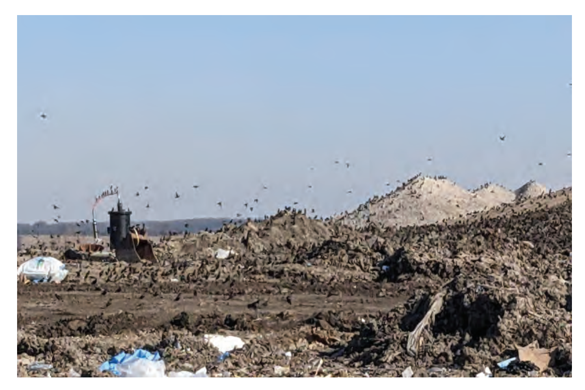
Cover roughly placed during operations