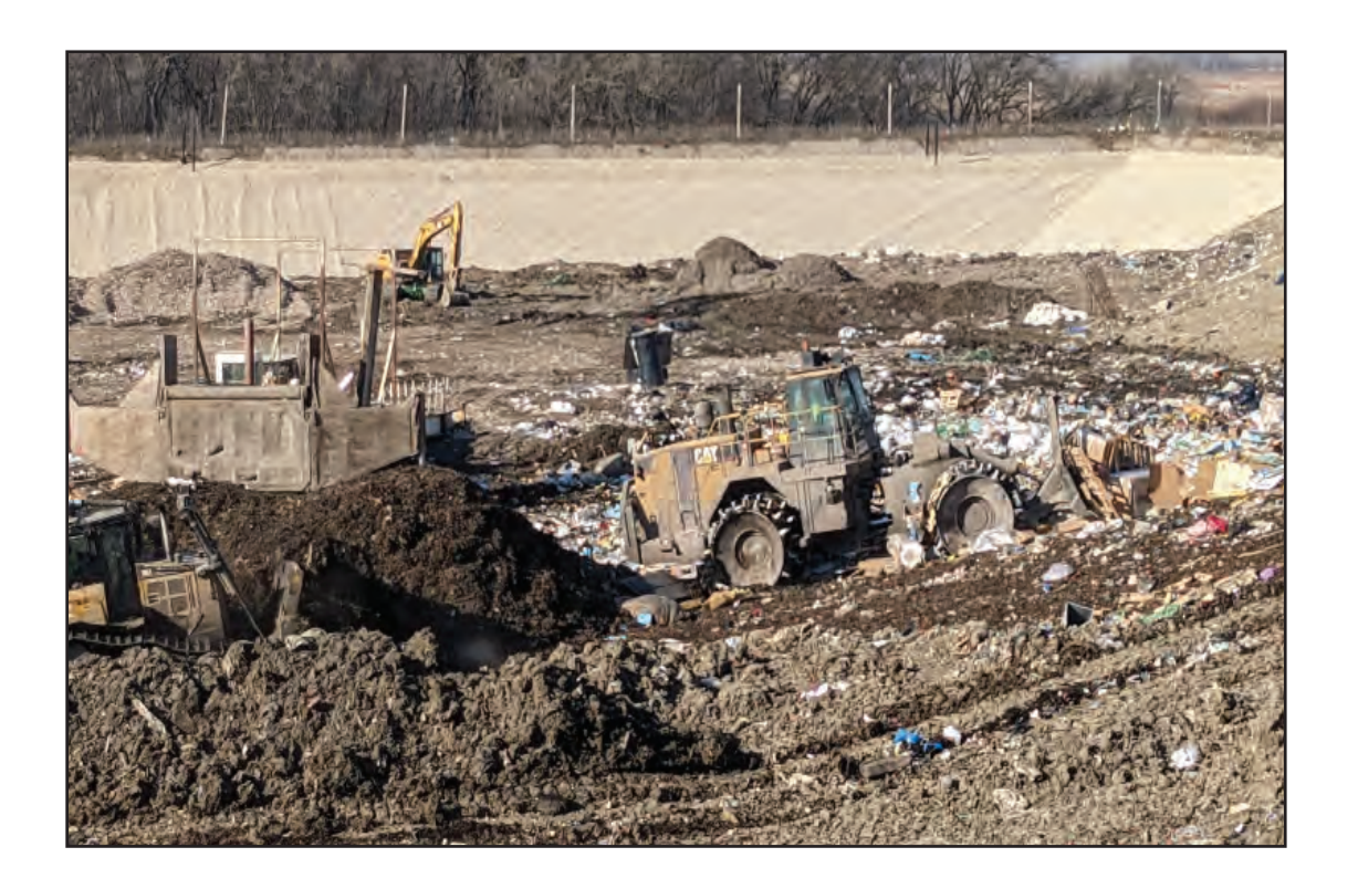
Phase 3 & 4 being brought to same elevation