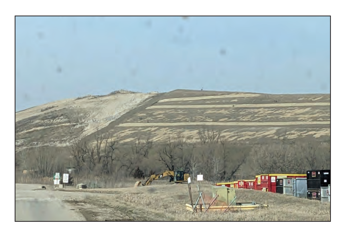
Cap project awaiting seeding and minor erosion repairs