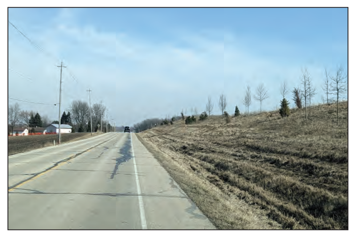
Screening berm along 38th Street; plantings appoear to be in bad shape. Contractor responsable for restoration