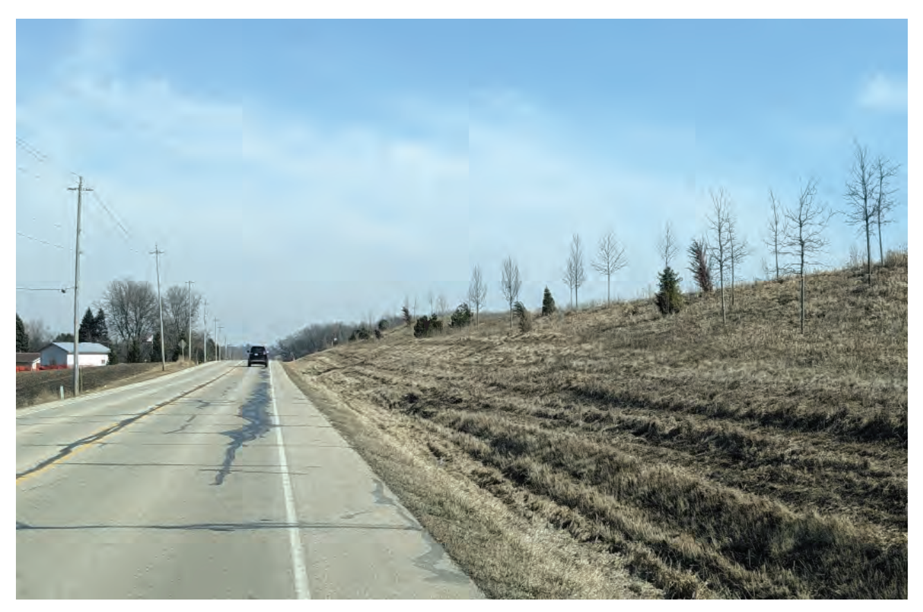
North screening berm, near corner of 38th Street and HWY 45