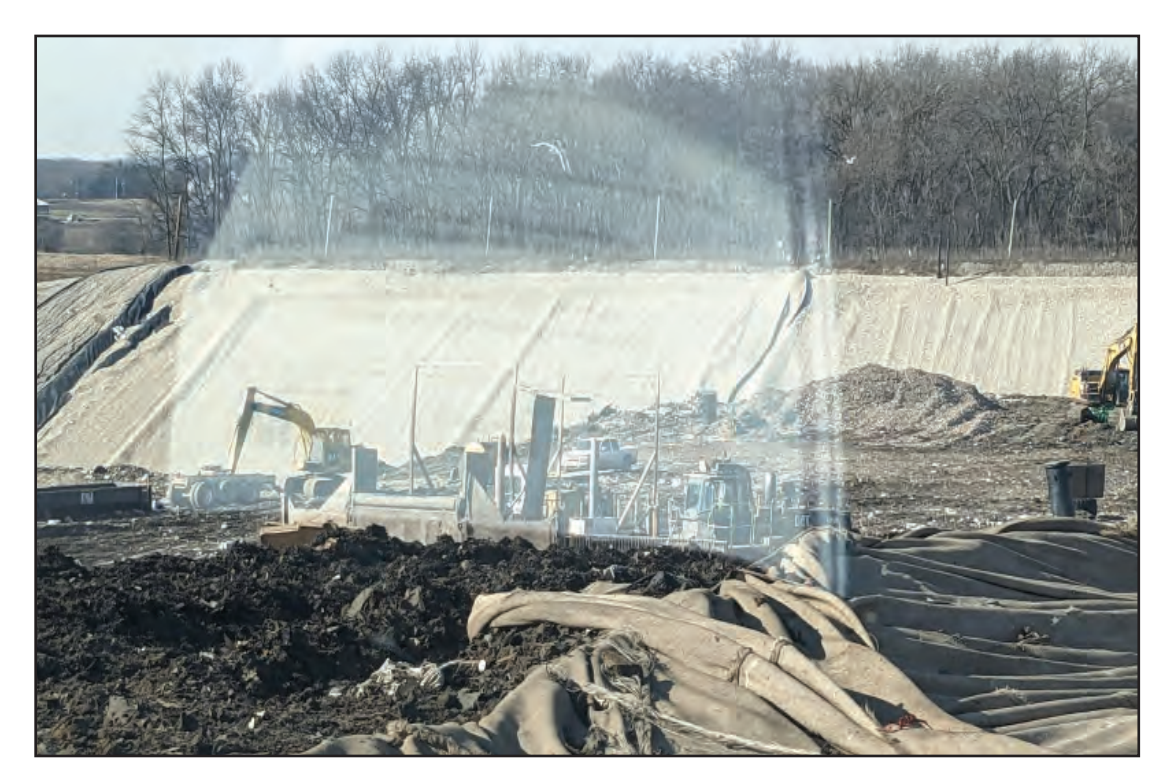
Tipper in Phase 4