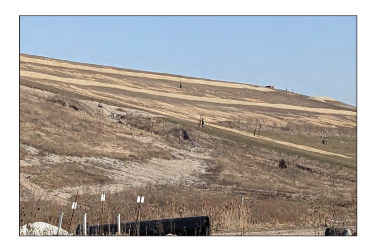
Cap project awaiting seeding and minor erosion repairs